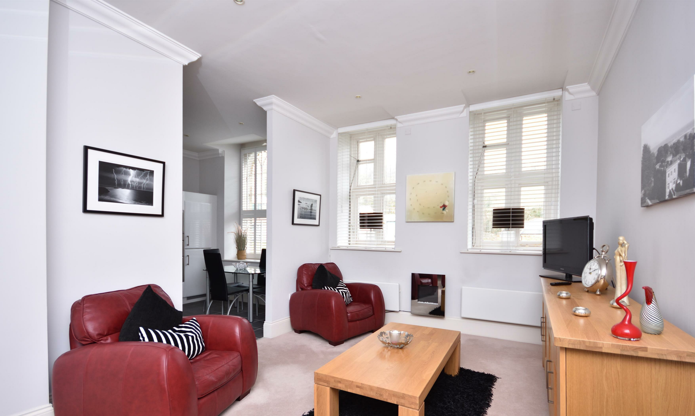
12 Clyne Castle Blackpill, Swansea, SA3 5BW £975 PCM